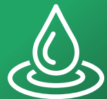
Auxiliary Cooling Water